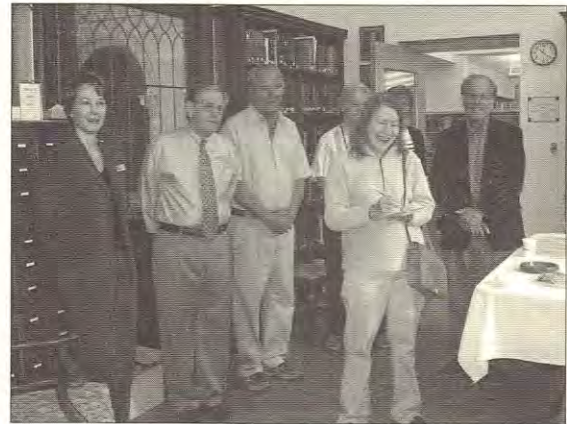
Enjoying the opening-day reception