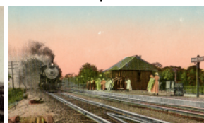
Sound View Station, circa 1925.