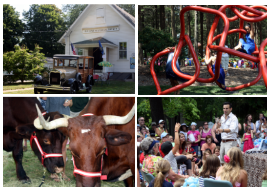
Midsummer Festival

fireworks display that night. The Festival has turned into a delightful and eagerly-awaited street fair. The Historical Society is delighted to be a partner in this endeavor, and is planning some special events of its own. We are delighted that Area 4 (Eastern and Southeastern Connecticut) of the Handweavers Guild of Connecticut will be at 55 Lyme Street. The Guild was founded in 1948 to bring handweavers, spinners, and other fiber artists together to share knowledge, exchange ideas, and educate the public in this traditional craft. There will be an exhibit of items made by the Old Lyme Handweavers circa 1961 including bolts of woven fabric, articles of clothing and handwoven rugs. There will also be weavers demonstrating on three or four different types of looms. Come and be inspired by the magic of weaving. There will also be tours of the completed state-of-the-art Archives in the lower level of the building.