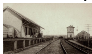
Lyme Station, circa 1900.