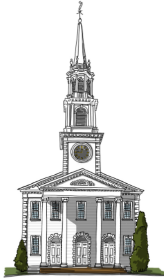
First Congregational Church

Last fall the Society released a new self-guided walking tour of the buildings on Lyme Street from its beginning at McCurdy Road to the John Sill house on the campus of the Old Lyme Academy College of Art. This spring we have expanded the tour to include the notable buildings north of I-95, from the Lyme Art Association and the Florence Griswold House to the former Peck Tavern at One Sill Lane (just beyond the Historic District). From McCurdy Road to the old Peck Tavern is a distance of 1.3 miles. At a leisurely pace, the round-trip walk should take less than an hour and a half. The buildings north of I-95 are covered in a separate sheet, making it convenient to break the tour into two nearly equal ~ 45 minute segments.