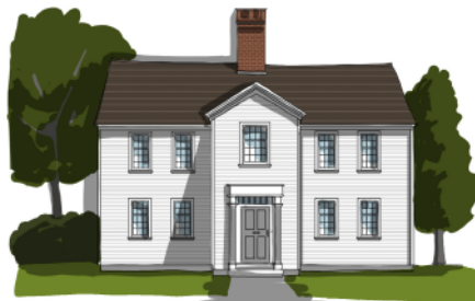
1 Sill Lane, Peck Tavern

More than 35 structures of historic interest are covered in the illustrated brochure. The buildings represent a mix of vernacular and formal architectural styles from the 17th century through the early 20th. The history of their various uses and owners reflects the ever-changing character of the town and region. Produced as a try-fold, full-color brochure on heavy stock, with drawings by Edie Twining and text by the Society, the tour is available for free at local merchants and at 55 Lyme Street.