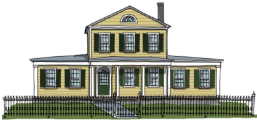
1 McCurdy Road