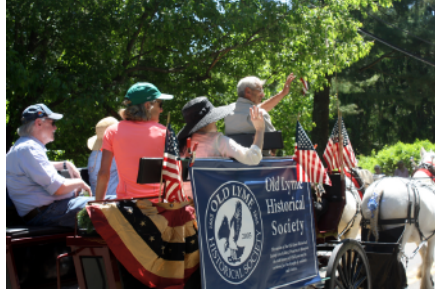
It was a beautiful spring day for the 2019 Old Lyme Memorial Day parade where OLHSI was proud to participate with many other civic groups in the parade and service at Duck River Cemetery.

Join us in our mission to collect, preserve, interpret and promote the rich history of Old Lyme.