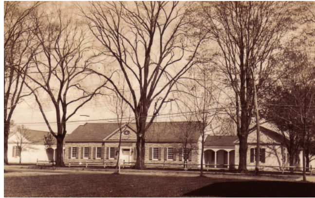
Center School, Lyme Street, circa 1935.