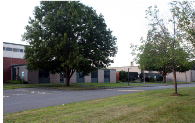
Old Lyme High School (now the Middle School) opened its doors in December 1957.

The school known today as Center School was built in the mid-1930s as a grades 1-8 elementary school known as the Old Lyme School. A few years later a high school wing was added with the first class graduating in 1941. (Previously, Old Lyme high school students went to school in New London.) By the mid-1950s, the school was feeling an enrollment crunch and plans were drawn up for a new high school (today's middle school). The Old Lyme School continued to serve grades 1-12 (no kindergarten yet—no room) until December of 1957 when the new high school opened.